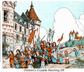
Children's Crusade Marching Off